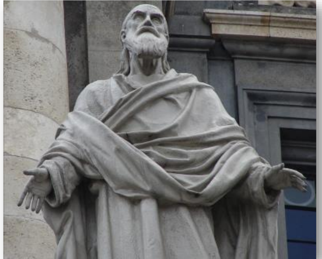
Polycarp was martyred in Smyrna in about 155 AD

“86 years have I have served Him, and He has done me no wrong. How can I blaspheme my King and my Saviour?”