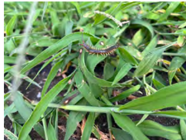
Centipede spotted whilst weeding.