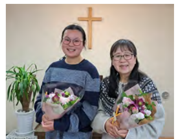
Last Sunday at Tachikawa Church.