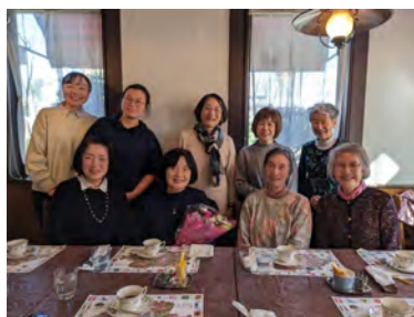
Former Kodaira Church Pastor retires.