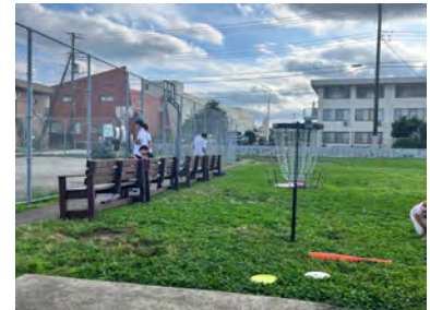
Kids reading Gospel comic.