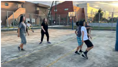
Before ankle break.

I'm really praying that the kids from the court can connect with the church.