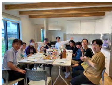
High School Group lunch & games.