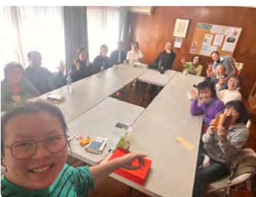
Last Thursday English Class.

I also finished off at Tachikawa Church! It's been good getting to know the kids and the congregation. I'm also very thankful for the platform and opportunities that they gave me.