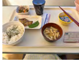
Nice nutritional hospital food.