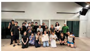
Young adults group dinner.

Please pray that God will lead me in my time here, and that it would be filled with mutually encouraging Christian relationships.