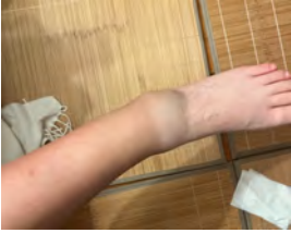
Probably just a sprain...