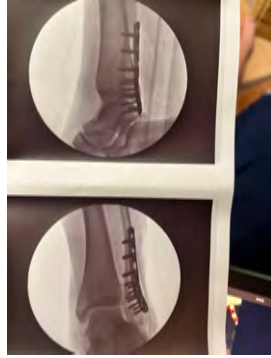
Nice titanium plate and 11 screws to keep things nicely together.