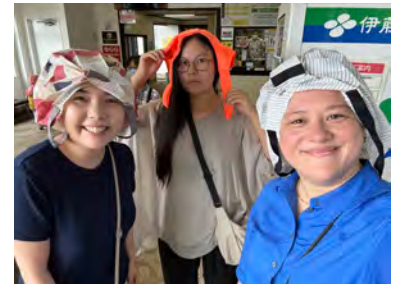
Caught in a sudden downpour!