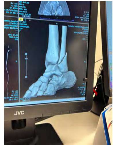
Nope, that diagonal line is not supposed to be there.

Also thank you so much everyone who was praying for me during this time! I've been making a very swift recovery!