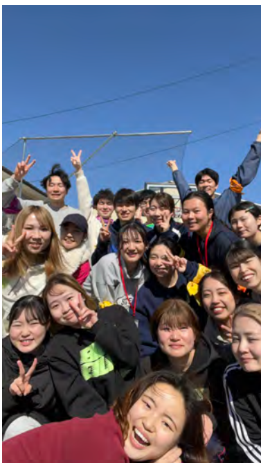
Sports Day for young adults!