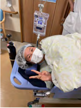
Getting wheeled in for surgery.