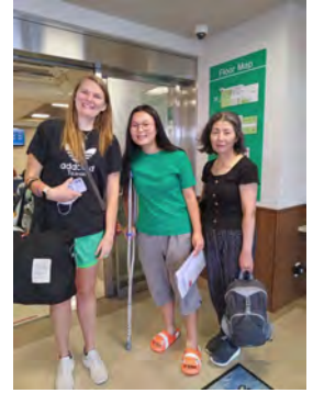
Discharged after about a 10 day stay! Was already walking with one crutch!