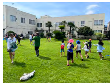
Sunday Kids: kids outreach event.