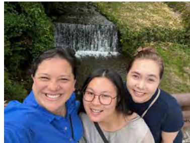
Stopping by a waterfall after meetings with the JHC Board.