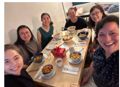
Fellowship dinner on Sunday night. A new Christian has recently joined our English service.