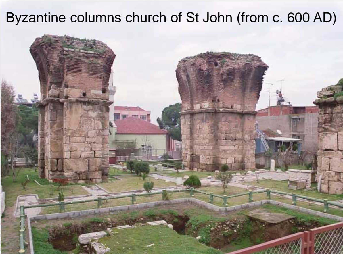
Byzantine columns church of St John (from c. 600 AD)